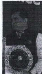
Mr. Amitabh Kant, IAS Chief Executive Officer, NITI Aayog, Govt. of India receiving the Golden Peacock Award for Leadership in Economic Transformation