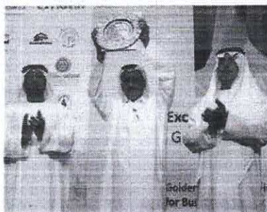
His Highness Sheikh Nahayan Bin Mubarak Al Nahayan, Cabinet Member and Minister of Tolerance, Govt. of UAE (Right) and His Highness Sheikh Ahmed Bin Saeed Al Maktoum, President, Dubai Civil Aviation Authority, Chairman and Chief Executive, The Emirates Airline & Group Chairman, Dubai World (Left) presenting the Golden Peacock Award to H.E. Dr. Khalid Ahmad Al Habtoor, Group Chairman, Al Habtoor Group, UAE (centre)

To create an Intra-Sector competitiveness , Golden Peacock Awards are considered separately under various Business Sectors and Sub-Sectors .