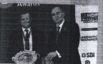
The Lord Johnson of Lanston CBE Minister of State for Investment in Cabinet Office and the Department for International Trade, Govt. of UK presenting the Golden Peacock Awards