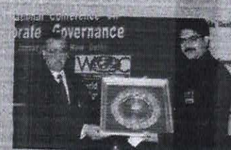
Mr. Kumar Mangalam Birla Chairman, Aditya Birla Group receiving the Golden Peacock Business Leadership Award

All entries/applications are treated in strict confidence and the entire evaluation process is confidential.