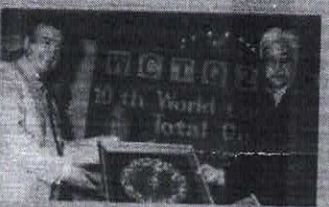
Dr. Adm H. Premji Chairman, Wipro Group receiving the Golden Peacock Business Leadership Award