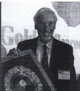
Sir George Adrian Hayhurst Cadbury Chairman, Cadbury and Cadbury Schweppes receiving the Golden Peacock Leadership Award for Lifetime Achievement in Corporate Governance

Even, if you don't win the award, the PREPARATION & FEEDBACK helps your strategic learning process to put you, on your way to achieving world class status