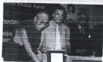
His Holiness The Dalai Lama presenting the Golden Peacock Awards in Palampur (Himachal Pradesh)

CHAIRMAN Hon'ble Justice M. N. Venkatachaliah former Chief Justice of India