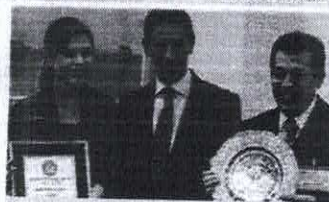
Banco Bradesco SA, Brazil receiving the Golden Peacock Award in Lisbon (Portugal)