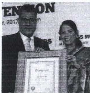
The Rt Hon Sir Alok Sharma KCMG MP, former President, COP26 and The Rt. Hon. Priti Patel MP, former Cabinet Minister & Home Secretary, Govt. of UK at the Annual London Global Convention 2017