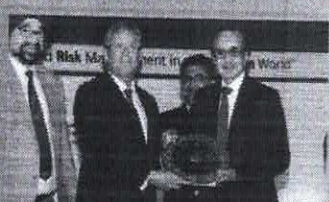
Mr. Adi Godrej Chairman, Godrej Group receiving the Golden Peacock Lifetime Achievement Award for Ethical Leadership