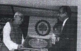
Mr. Sunil Bharti Mittal Chairman, Bharti Enterprises receiving the Golden Peacock Business Leadership Award