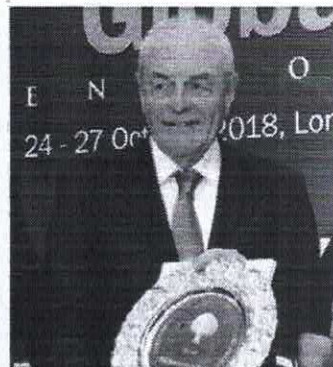
Prof. (Judge) Mervyn E. King SC Chairman, King Committee on Corporate Governance & former Judge, Supreme Court of South Africa receiving the Golden Peacock Global Award for Lifetime Achievement in Corporate Governance

Golden Peacock Awards, instituted by the Institute of Directors (IOD) , India in 1991, are now regarded as a benchmark of Corporate Excellence worldwide.